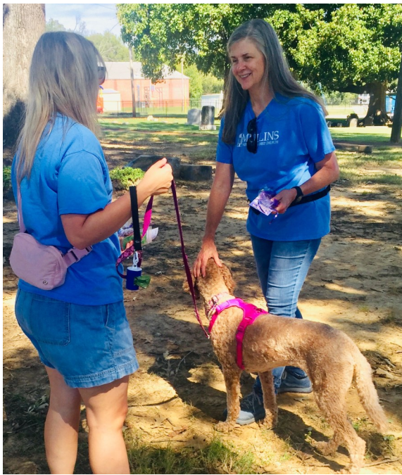
Blessing of the Animals!