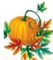
UWF Metro "Annual Day"