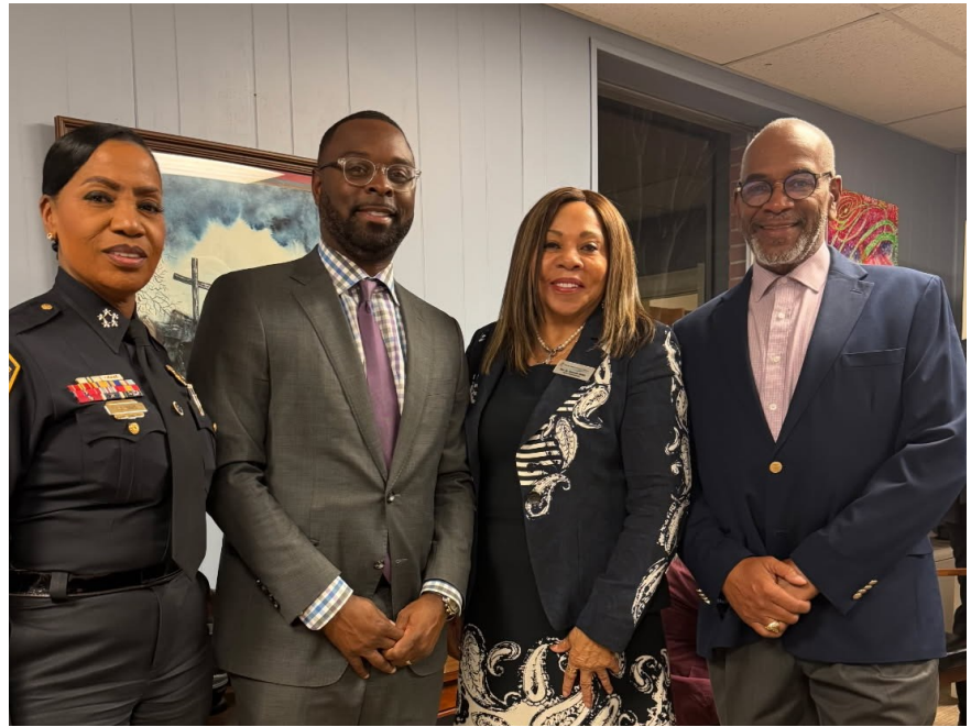
Hispanic Q & A and Worship Event